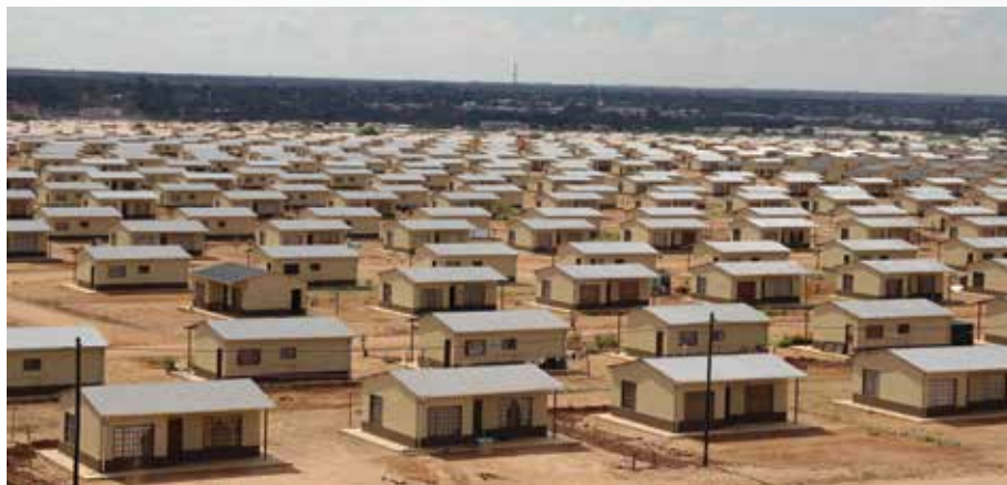
3 500 houses built

The first phase comprises of 400 middle-income houses and Council will avail more land for future developments depending on the demand. ■