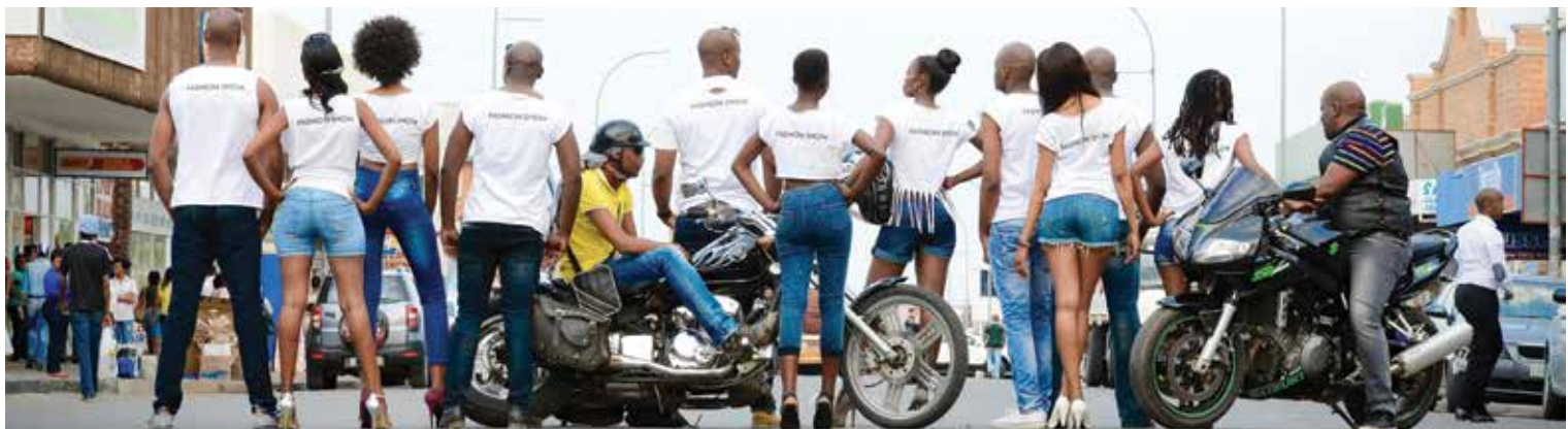
Fashion Show by Botaqi