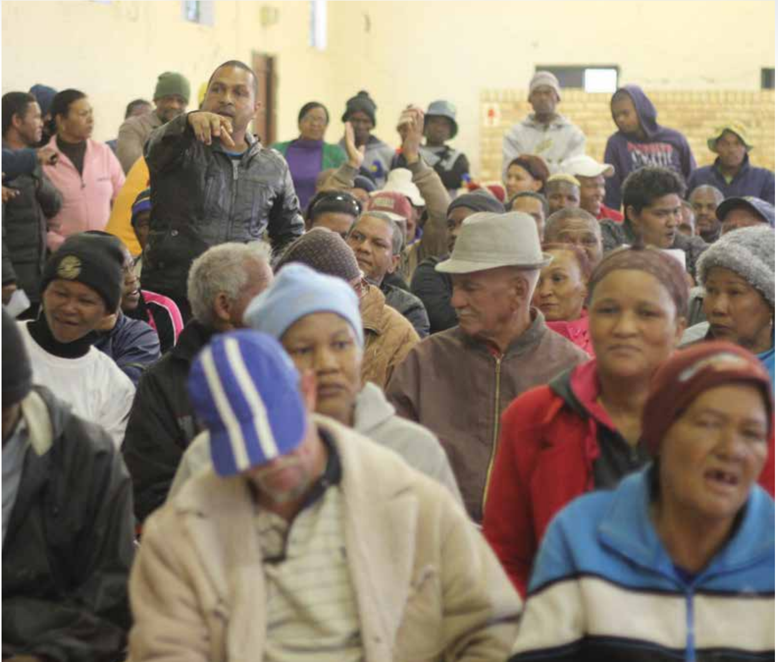
Community members of Ward 2& 3 taking an active role with regards to developmental initiatives.