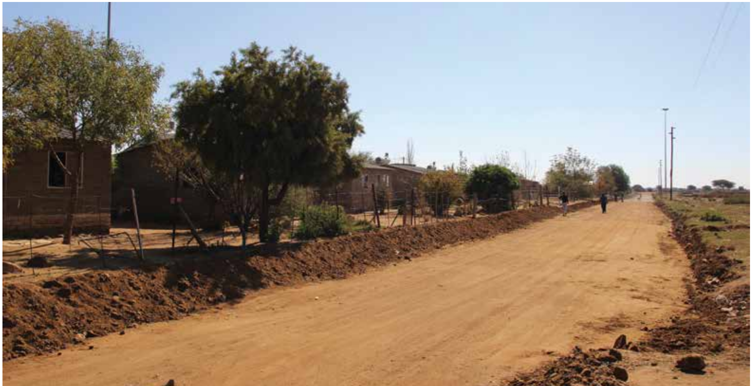
Paving of the roads underway in Rekgarathhile Township