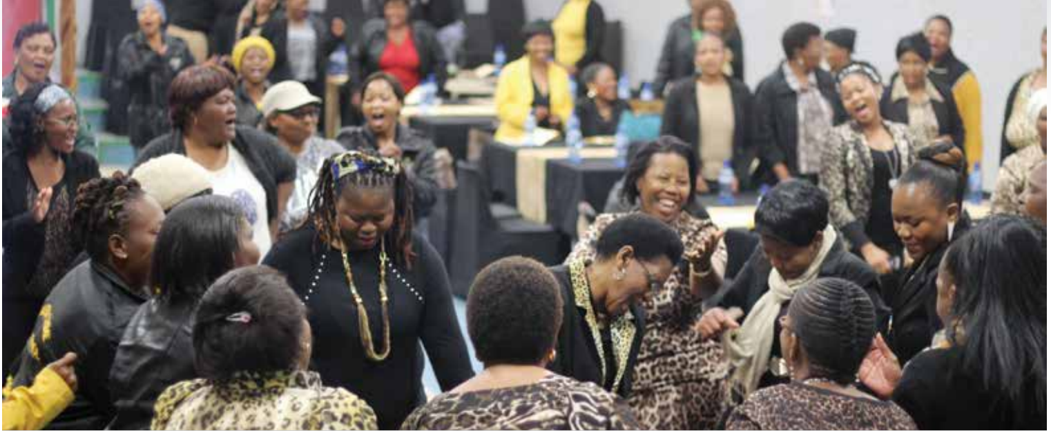
The women of Naledi celebrating their day to the fullest