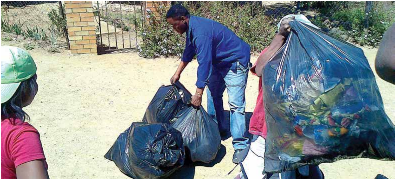
The Mayor S.T Modise on the ground practicing “back to basics” principles