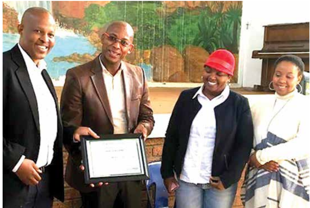
Our Waste management unit presented with the most improved landfill site management certificate in the North West province by the Department of Environmental Affairs