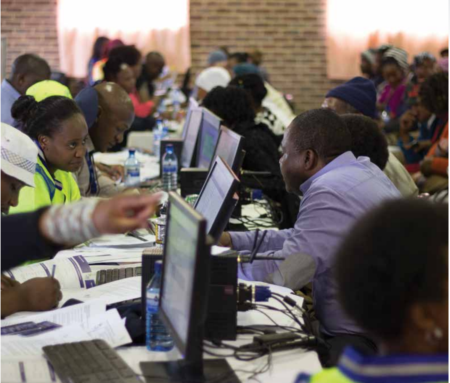
People receiving help from the road accident fund officials