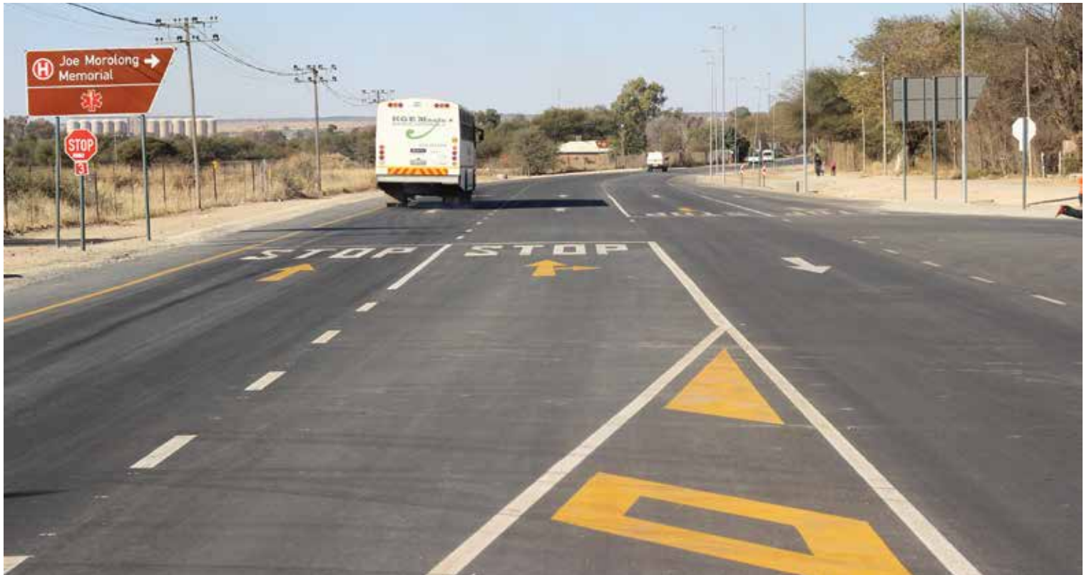
The newly built South Street connecting district hospital, traffic center and town cemeteries

List of completed and current streets: Rooyden Road, Isaac Peloeng Street, Desmond Setlhauno Street, N18 Slip Way, Matlhoko Street, Mokgosi Street, Thibogang Street, Ngaba Street, Bareki Street, Lokwaloeng Street, Aukatz Street, Brenda Fuleni Street, Elizabeth Moroka Street, Jomo Khasu Street, Sello Maphalle Street, South Street, Dr Nelson Mandela Drive, Albert Kekesi Street, Motlha Leemang Street, Tladi Street, Korana Street, Mathimba Street, Brenda Fuleni Street, Mogopelwa Street, Bakri Street, Rosyntjie Street, Diamant Street, Matoppie Street, Flamink Street, Share Crescent Street, Kraanvol, Skool Street, Papagau Street, Tierog Street, Darkey Africa Street, Thabo Mbeki Street, Chris Hani Street, Sol Plaatjie Street, Dr Nelson Mandela Street, Makgobi Street, Keitebetse Street, Pitso Street. ■