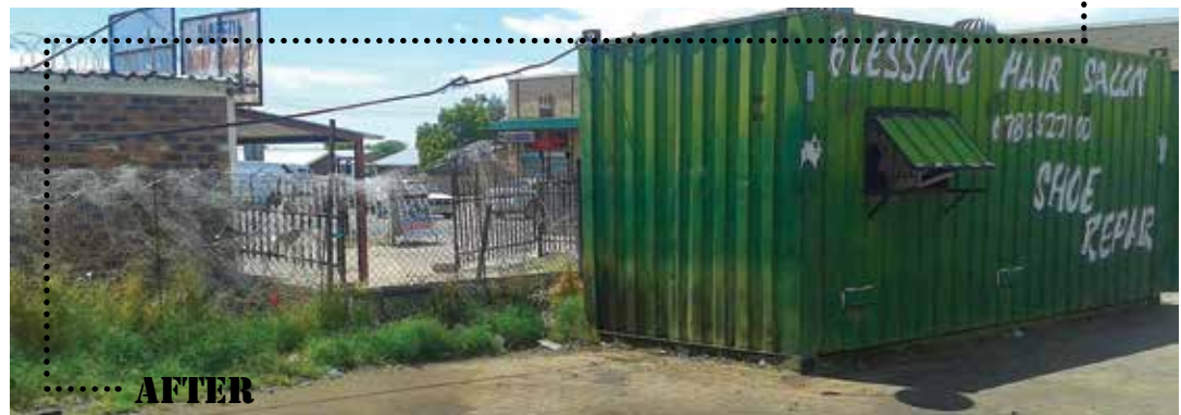
EPWPs have played a big role in ensuring that our town stays clean and maintained on a regular basis.