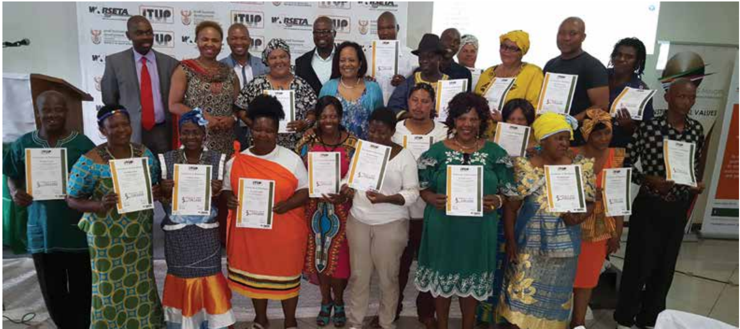
Minister Lindiwe Zulu awarding some of our entrepreneurs with Business Development Certificates