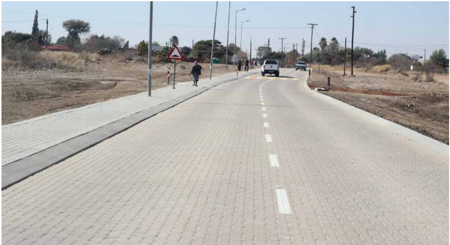
Rekgarathhile link road has made transport easy between Rekgarathhile Township and Stella Town easy with its sidewalk, lights and state of the art paving.

R ekgarathhile road users have been using graveled roads to either drive or commute to town. The residents of Ward 1 have a new road linking the township of Rekgarathhile and Stella town. It has become easier for drivers, commuters and pedestrians alike to access town. The link road is 5km long and has been fitted with side-walks and a proper storm water management system. The size of the road is 6mm wide and more. Temporary jobs and skills transfer were the benefits of the project and R3.1 million was spent to implement the project. ■