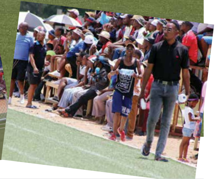
Multichoice disk challenge - Platinum Stars vs Kaizer Chiefs