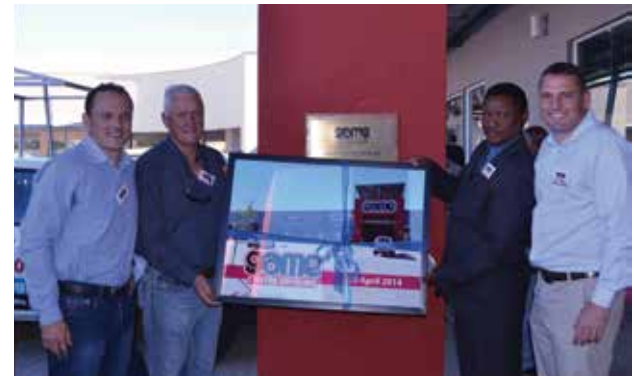
Mayor Modise at the opening of the New Game Store in Vryburg