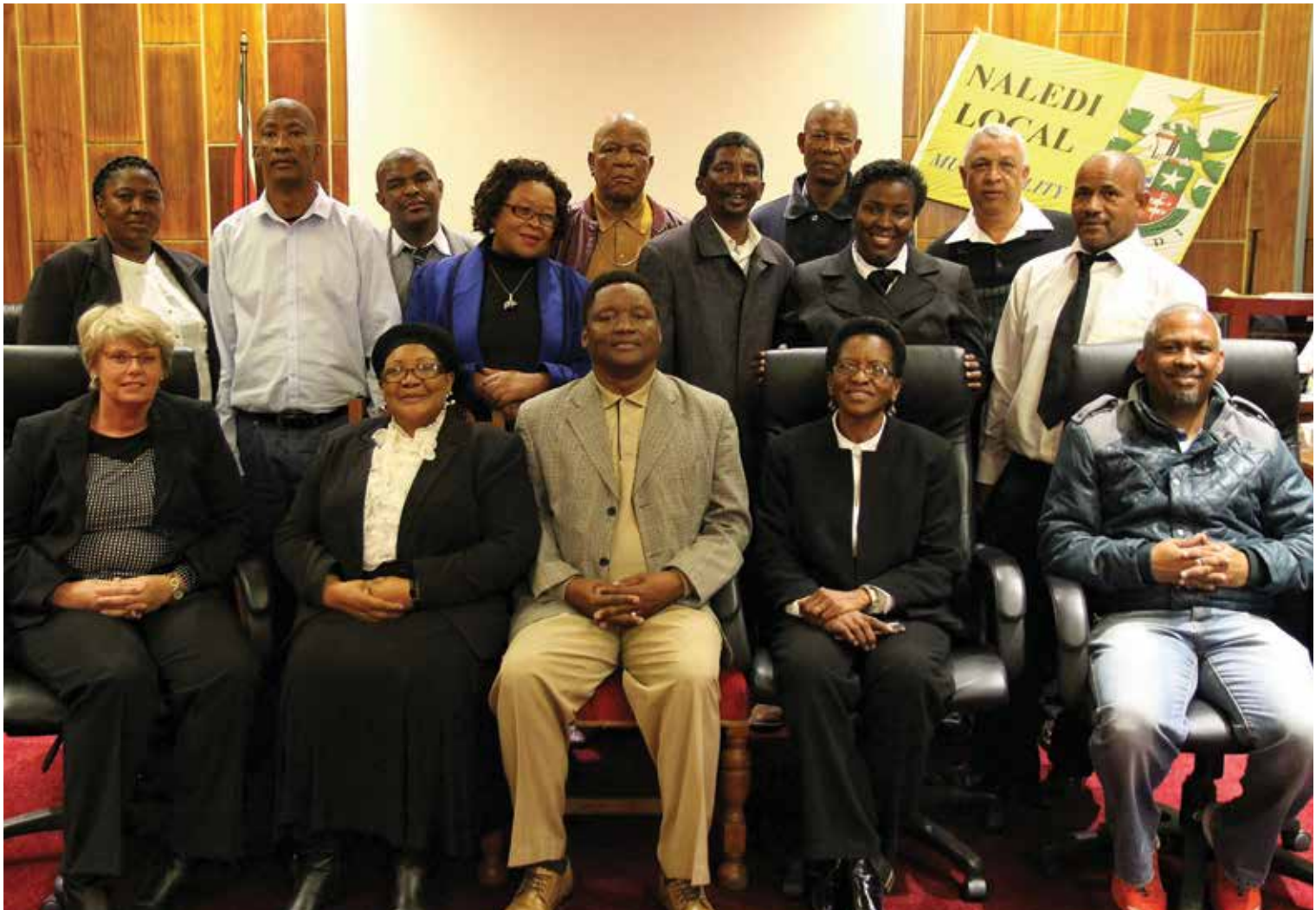
Naledi Local Municipality Council