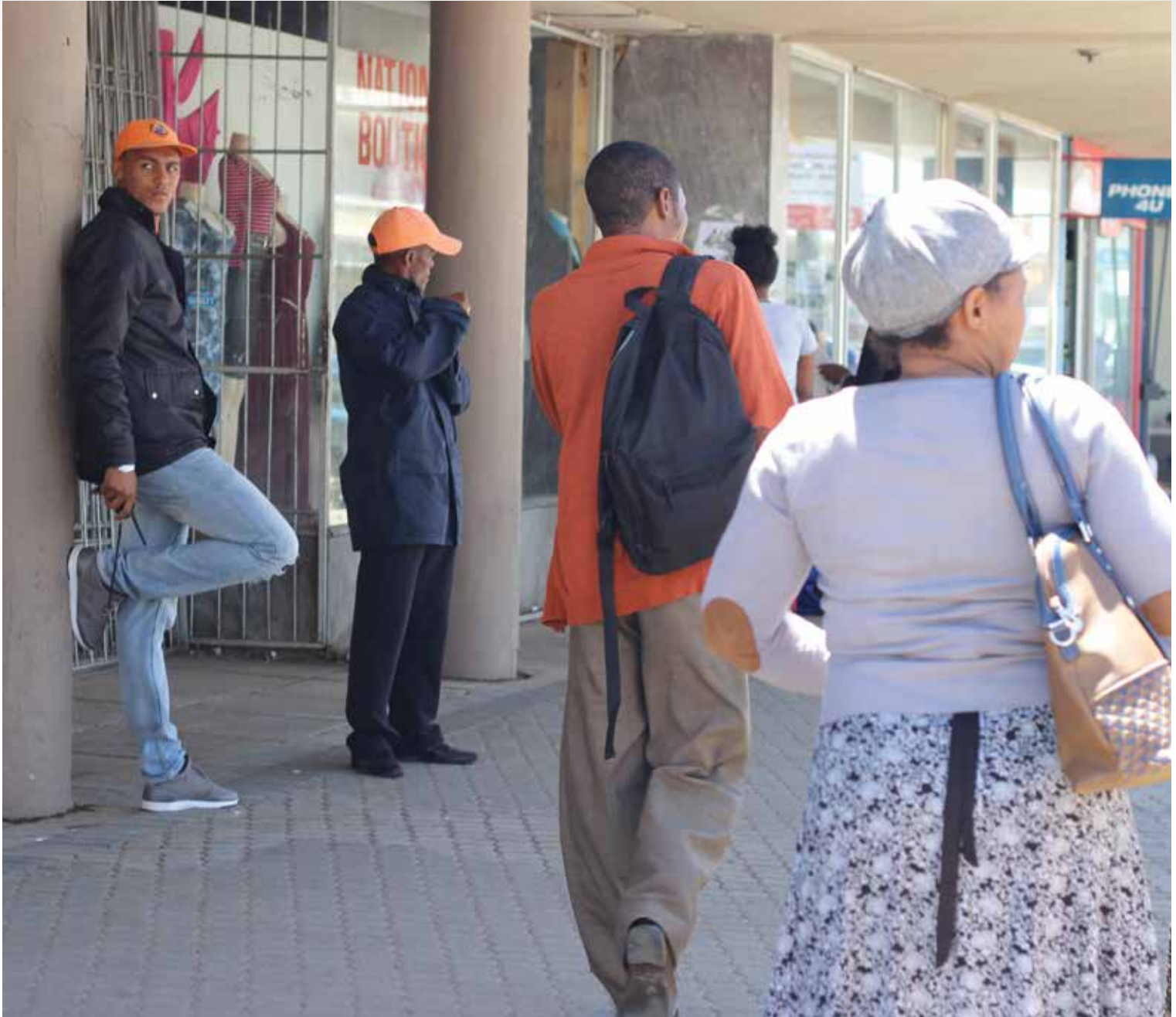
Due to visibility of crime patrolers in town, shopping has become safe and stress experience free