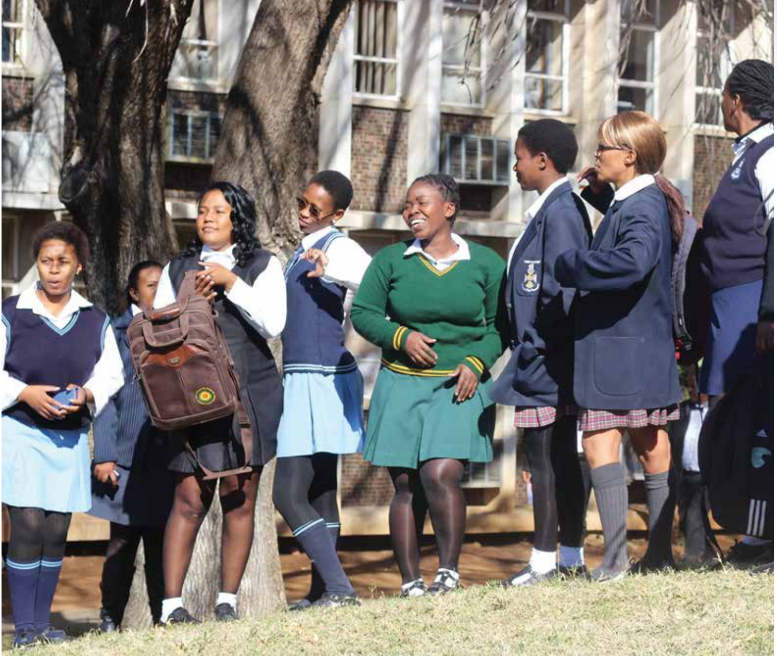
Youth day means a lot to the employees of the municipality. It is celebrated every year where you find employees dressed up in school uniform showing respect to those that sacrificed their lives for a greater course in June 16 of 1976