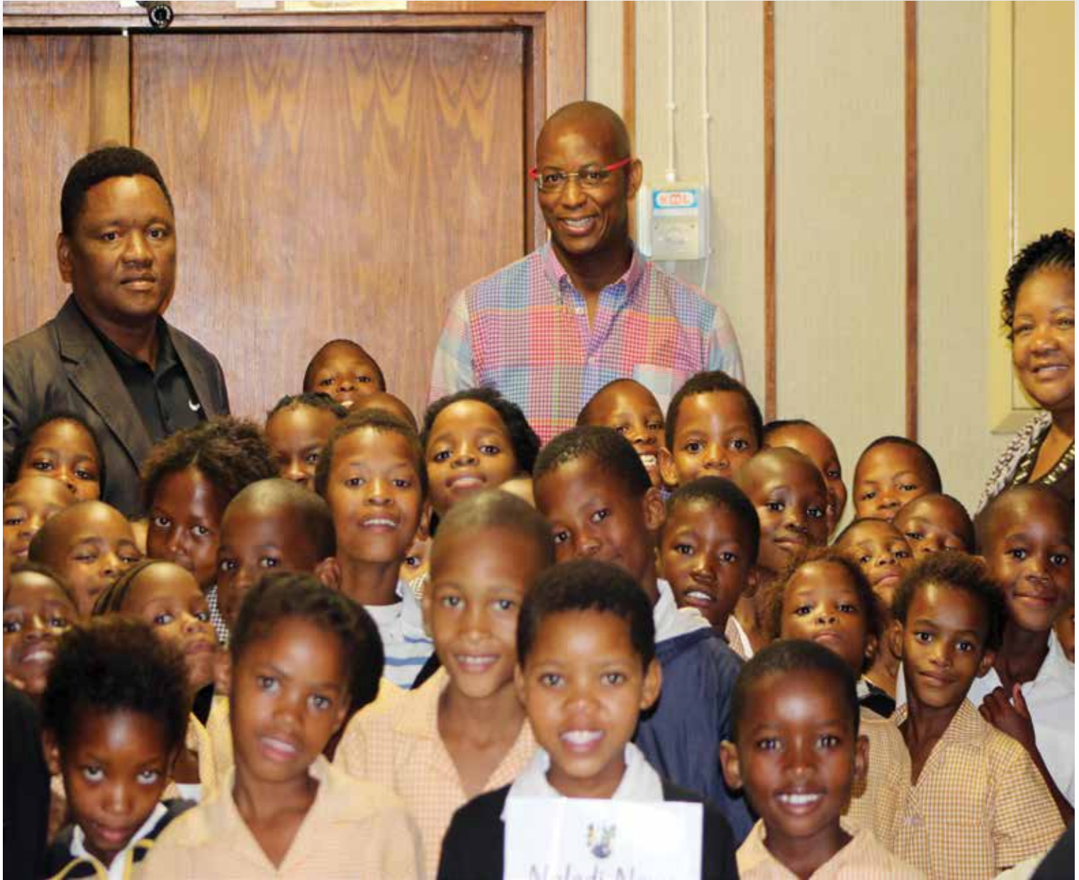
Regular primary school excursions to the municipality. Young ones always excited to meet the Mayor, Municipal Manager and Speaker, where they learn more about what services the municipality offers.