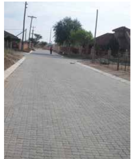
Elizabeth Moroka Street is also part of the newly paved streets in Huhudi