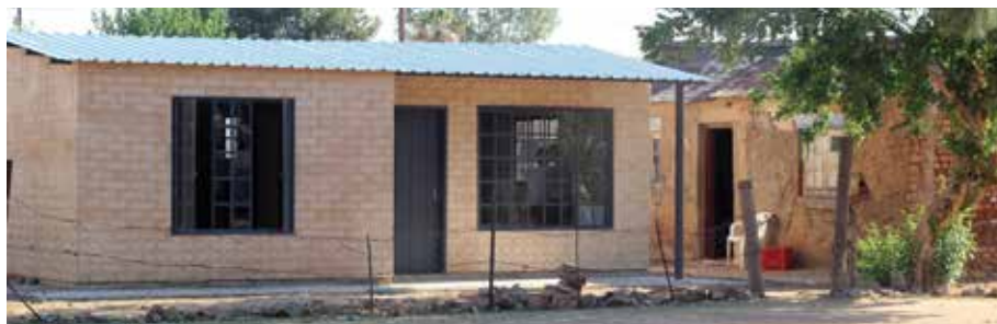
As part of revitalising the old township, the municipality built houses for dilapidated homes in Huhudi