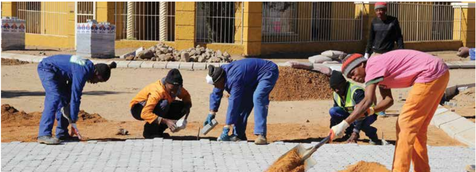
Makgobi Street being constructed and expected to be completed and handed over in September 2016