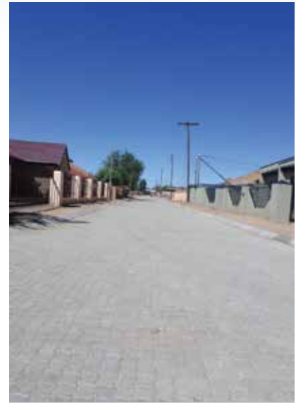
Brenda Fuleni Street - This is one the new roads built in this financial year (2015-16)

This is an achievement we can all be proud of as we move Naledi Forward. Over 10 000 households are beneficiaries of these beautiful roads which all meet the criteria for quality roads. The 37 roads that were built were properly as there was an existing backlog. In Huhudi priority was given to taxi routes, access to public amenities such as clinics, cemeteries, schools and churches. In Colridge we prioritised linking previously segregated communities, roads used for economic purposes such as the auction place for animals, storm water management and erosion. Indeed Naledi Local Municipality has the interest of the people at heart and will always be here to serve its communities in a better way and therefore improving lives of its residents. ■