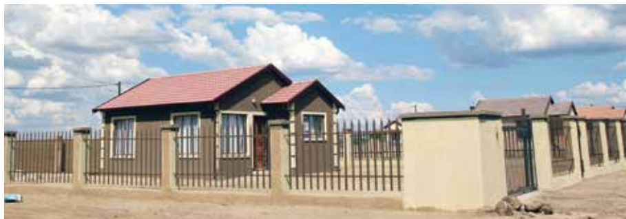
400 houses for middle income earners (FLISP)