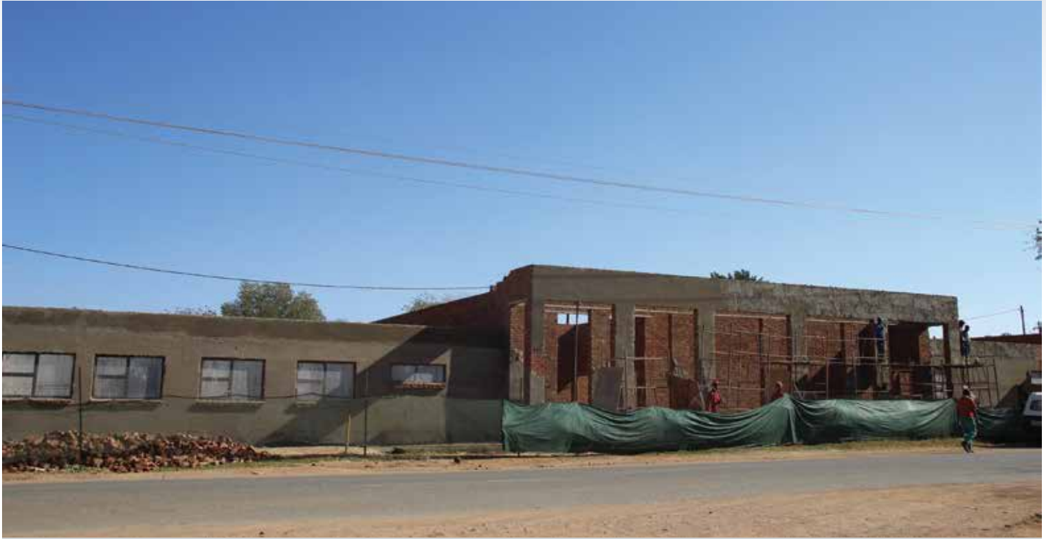
New Offices under Construction