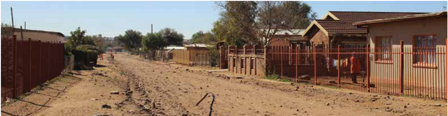
Barkry Street under construction

There are current projects underway which started the last financial year, upgrading of access roads in Rekgatlhile (5), Huhudi (5) (and Colridge(9). A total of 19 streets are being constructed and the project is expected to be completed in September. In this financial year the department of Public Works will construct the Dithakwaneng link road. The municipality has further budgeted and advertised for the construction of the extension 25/28 taxi route for R3.5 million. ■