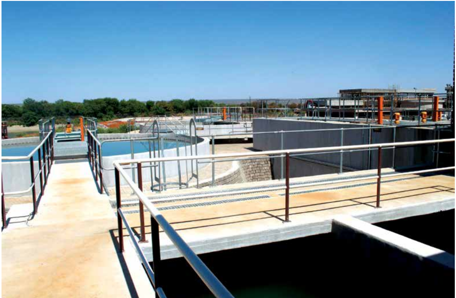
Water purification plant in Pudumoe

W ater is a scarce resource. The present administration will stop at nothing to bring relief to its communities. Water is a basic need and without it no one can survive. There is basically a new suburb under construction with this project. Seventy five percent of our water is from bore-holes so the municipality cannot afford contaminated water. The expansion of the industrial water bulk line is also an expansion of municipal revenue. This project has helped support industries and the establishment of a new suburb. The municipality with this in mind committed R3, 5 million on the construction of the industrial water bulk line. The levels of water in our reservoirs have improved drastically. For the first time in a decade the main reservoir which is Vryburg stands at a level ranging between 80 and 100% daily. Huhudi reservoir is always almost on 100% level provided there are pipe bursts. ■