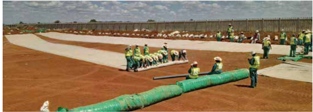
Geosynthetic Clay Liner_Imported

Naledi Local Municipality is in full support of recycling as a driver of economy in South Africa (SA). The Sorting Area will be used for recycling in Naledi hence the Weigh Bridge will augment and compliment the landfill by fully giving the Waste quantities entering and recyclables leaving the site for further processing. This will enable the Municipality for better planning. A Study done by Afri-Forum commended Naledi's new land fill site as number one nationally together with Hermanus Municipality in the Western Cape with 98% respectively in terms of meeting the criteria for compliance as set out by the standards of DEA. The landfill site also won the award for the most improved site in the province. We are proud for this achievement. ■