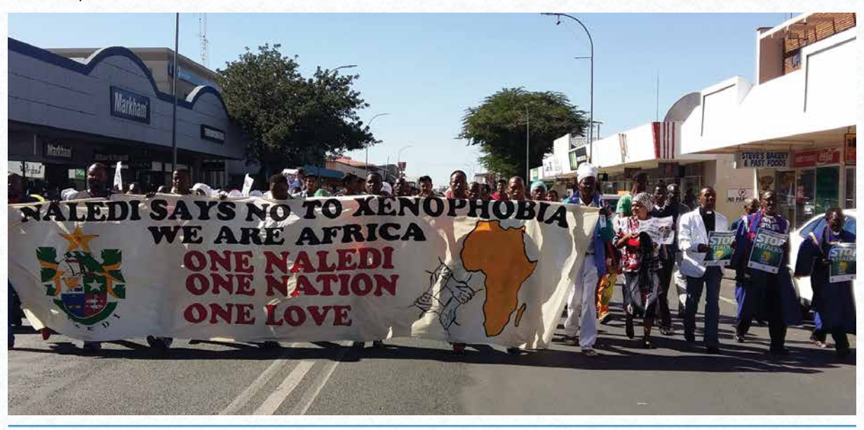
Naledi Local Municipality is against xenophobia. The mayor of Naledi held a march against violence on foreign nationals. When the destitute family in extension 28 needed help foreign business came to their aid. We are all even one should embrace and learn to live peacefully with each other.