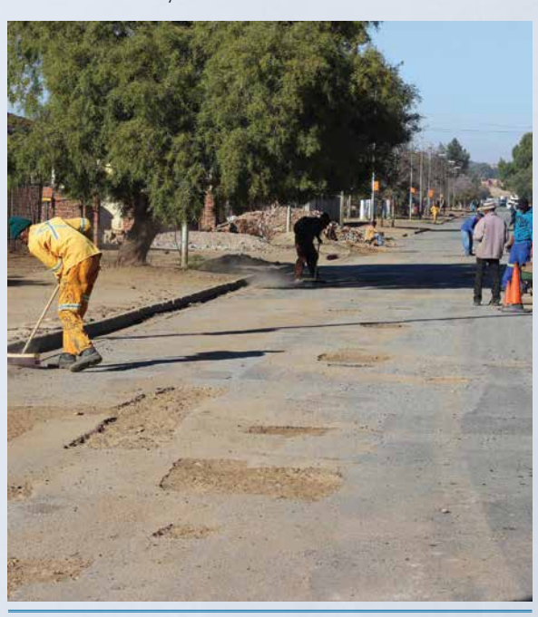
EPWPs, CWP and contract workers resealing the Mahikeng road

There are 404 Expanded Public Works Programme (EPWP) beneficiaries, 714 Community Work Programme (CWP) beneficiaries in our municipality who deliver the abovementioned essential services. Though some may give the program a bad name by loitering doing nothing, most of the roads have been rebuilt by EPWP beneficiaries and we owe the cleanliness of our town to these beneficiaries. We salute the youth who are engaged in this youth service to their community.