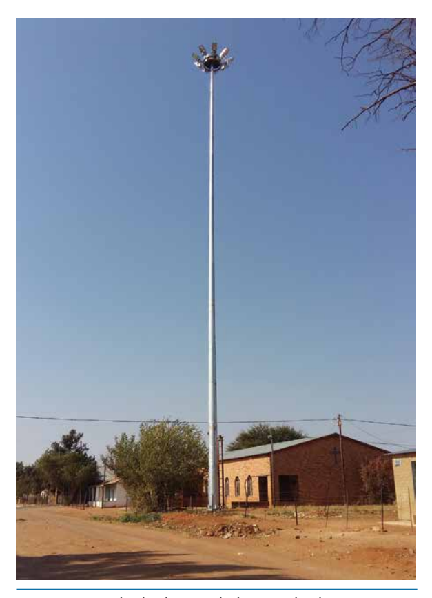
The high mast light in Huhudi

The project's duration is 7 months which started in January 2015 is expected to be complete in July 2015. The construction of the lights is complete and most of them are working. Employment of 24 people was created.