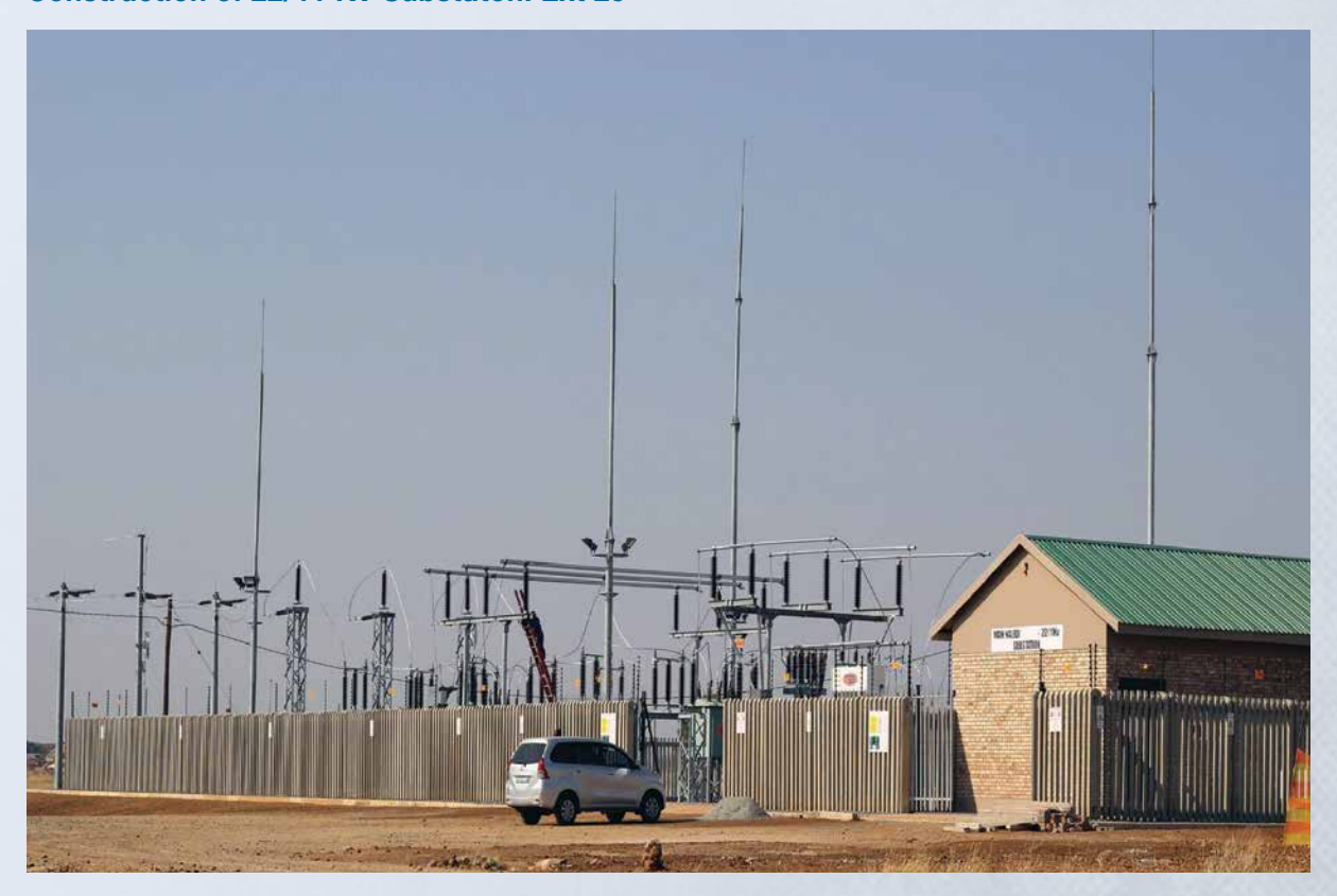
The power substation at Extension 28.

A new substation that will light up 4000 houses of Extension 25 is 95% done and will be running in no time. This project entails the supply, delivery and installation of a 22/11 kV 5 MVA Electrical YND 1 Substation and the installation of a transformer and the supply and installation of a new 88 kV Chicadee line.