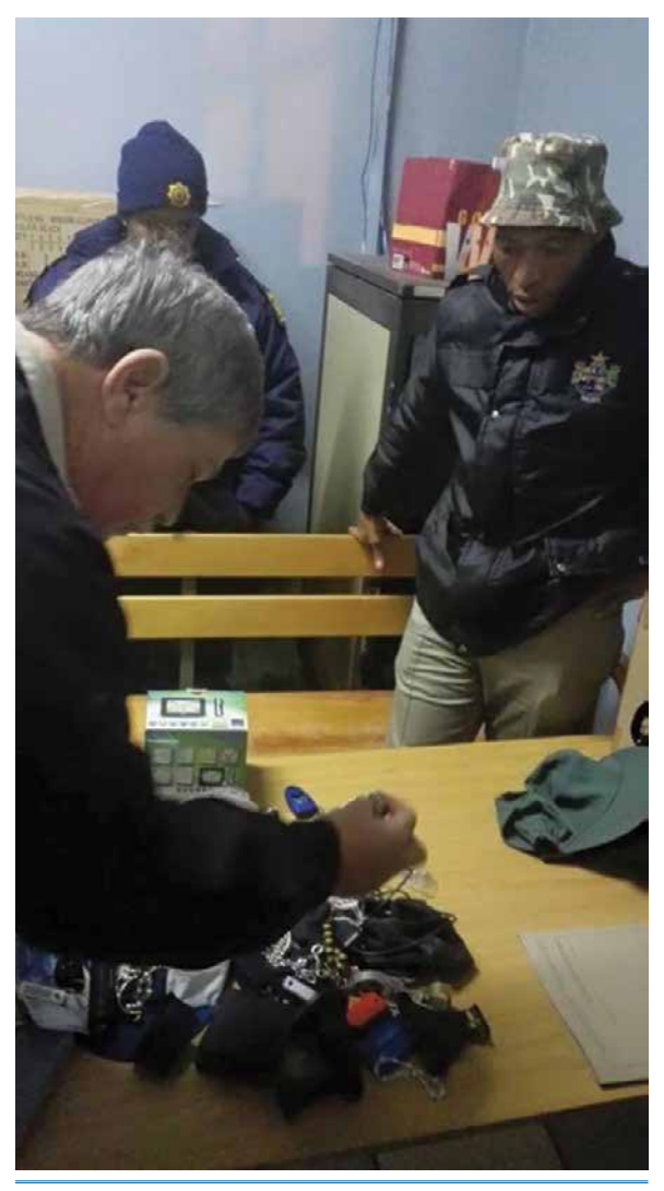
Recovered goods returned to the police by the Naledi Crime patrollers

Gone are the days when the streets of Vryburg CBD used to be controlled by a criminal gang which used to prey on old and vulnerable citizens, especially women, snatching their handbags, breaking into their cars, robbing them in broad daylight. These criminal elements used to do this with impunity secure in the knowledge that chances of being caught were limited, not to mention their successful prosecution.