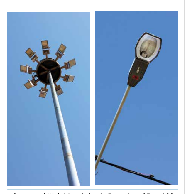
Street and High Mast lights in Extensions 25 and 28

Naledi Local Municipality still improves safety for its communities. It is important that all communities should have lights in and outside of their homes. There are 65 streetlight poles erected and 386 fitted 250 X 70 Watt and 136 X 120 Watt lights at Extension 25. An estimate of 3987 will benefit from the lighting and five jobs were created.