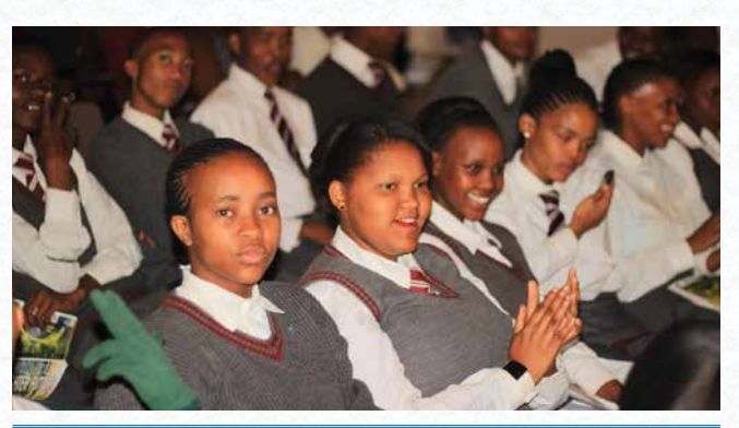
Curious minds at the career exhibition