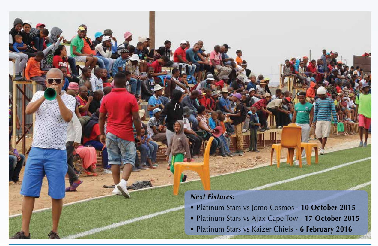
People came in numbers, yound and old to support Platinum Stars in their first home match at Huhudi Stadium

The MultiChoice Diski Challenge consists of 16 teams which are representative of the general PSL. The two groups play against each other in an eight-team competition that comprises of group stages, quarterfinals, semi-finals and finals. The rules and regulations of this league are determined by the PSL. Platinum Stars has met up with the officials of Naledi Local Municipality and Dr Ruth S Mompati District Municipality to host their games in Vryburg. This is the biggest event we've had in years hosted at our sporting facilities. Platinum Stars played University of Pretoria over the weekend of 12 September 2015 and plan to host more of their home games in Naledi. Platinum Stars represents our province in the PSL and Naledi Local Municipality is a proud supporter of Dikwena.