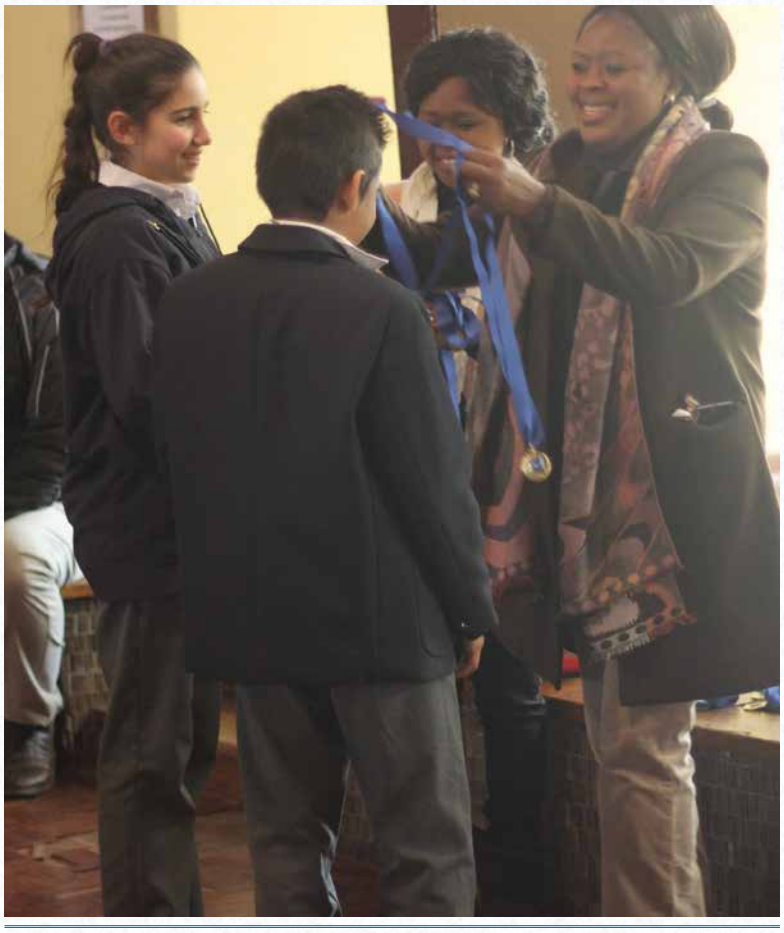
The District Science Expo was held at the Vryburg Banquet Hall