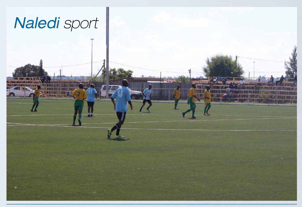
Naledi local Municipality hosted the provincial municipal games

The Naledi Local Municipality Sports Unit has structured the sports development in three main pillars; an enabling environment, an active Naledi and a winning Naledi. In these pillars, the Sport Unit has set its key performance indicators.