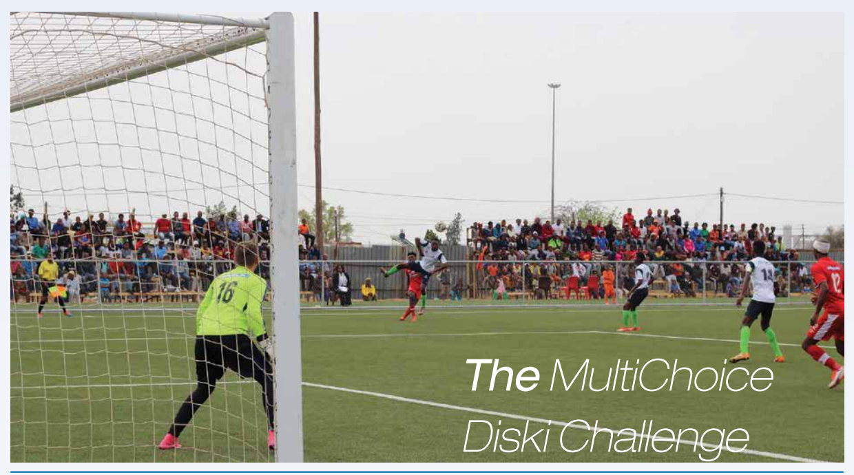
There were no complaints about the pitch being bumping or any criticism of some sort. We have high class facilities and we say that in confidence

The MultiChoice Diski Challenge consists of 16 teams which are representative of the general PSL. The two groups play against each other in an eight-team competition that comprises of group stages, quarterfinals, semi-finals and finals. The rules and regulations of this league are determined by the PSL. Platinum Stars has met up with the officials of Naledi Local Municipality and Dr Ruth S Mompati District Municipality to host their games in Vryburg. This is the biggest event we've had in years hosted at our sporting facilities. Platinum Stars played University of Pretoria over the weekend of 12 September 2015 and plan to host more of their home games in Naledi. Platinum Stars represents our province in the PSL and Naledi Local Municipality is a proud supporter of Dikwena.