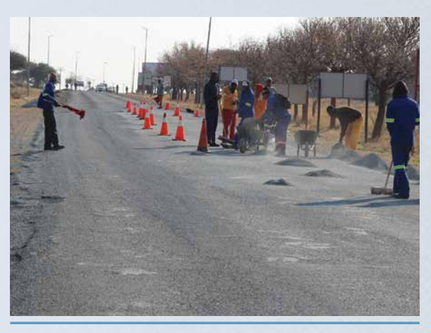
EPWPs, CWP and contract workers resealing the Mahikeng road